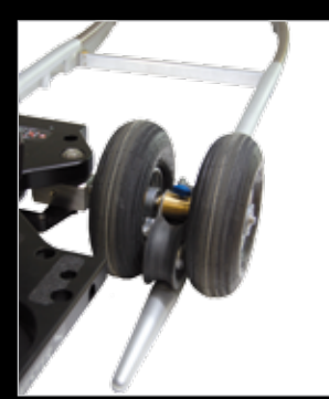
By the combined tyre and track wheels you change between shots on tyres or on tracks without time consuming conversion.